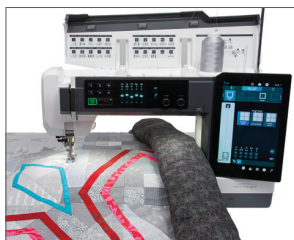
850 Built-in Stitches & 1,250 Built-in Designs