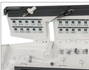
Self-opening, Magnetic Top Cover