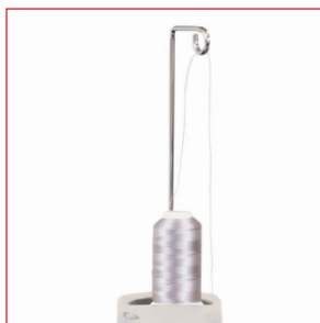
Built-in Telescoping Thread Stand