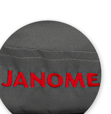
Stain resistant material