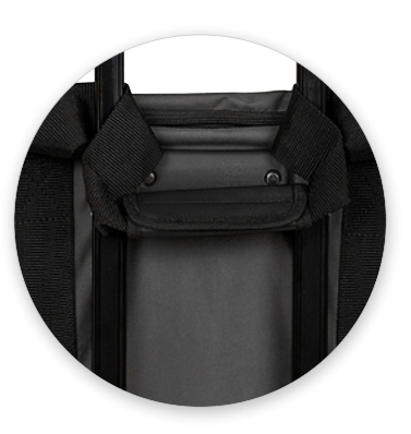
Carrying handles for easy lifting over stairs or curbs