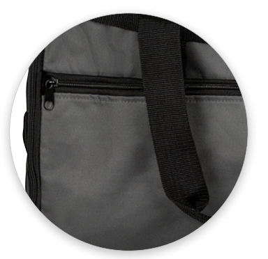
Front zipper pocket