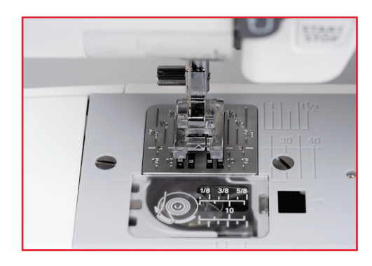
Horizontal Rotary Hook Bobbin