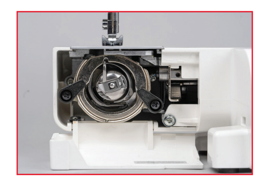
Front Loading Vertical Oscillating Hook