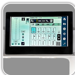
7" Color LCD Touchscreen