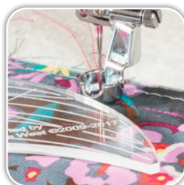
Ruler Quilting Function