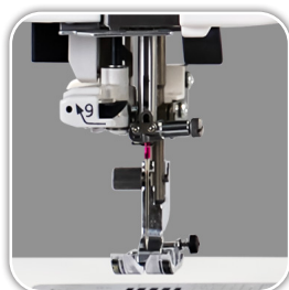
Enhanced Superior Needle Threader