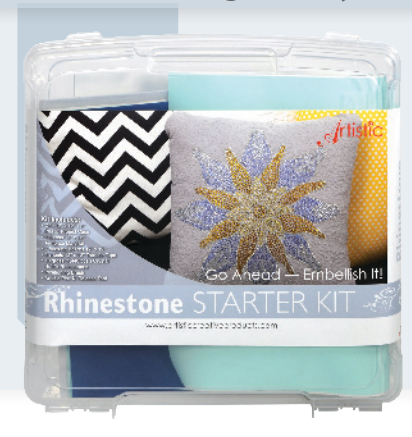
Rhinestone Starter Kit

The Artistic Rhinestone Starter Kit contains all of the materials necessary to create and transfer rhinestone designs to your sewing or crafting project.