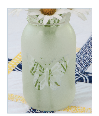
Create stencils for glass etching and painting