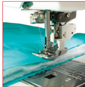
AcuFeed Flex Layered Fabric Feeding System