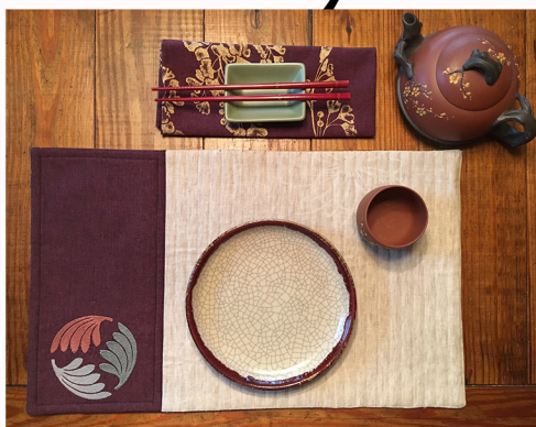
21" x 63" Finished Table Runner