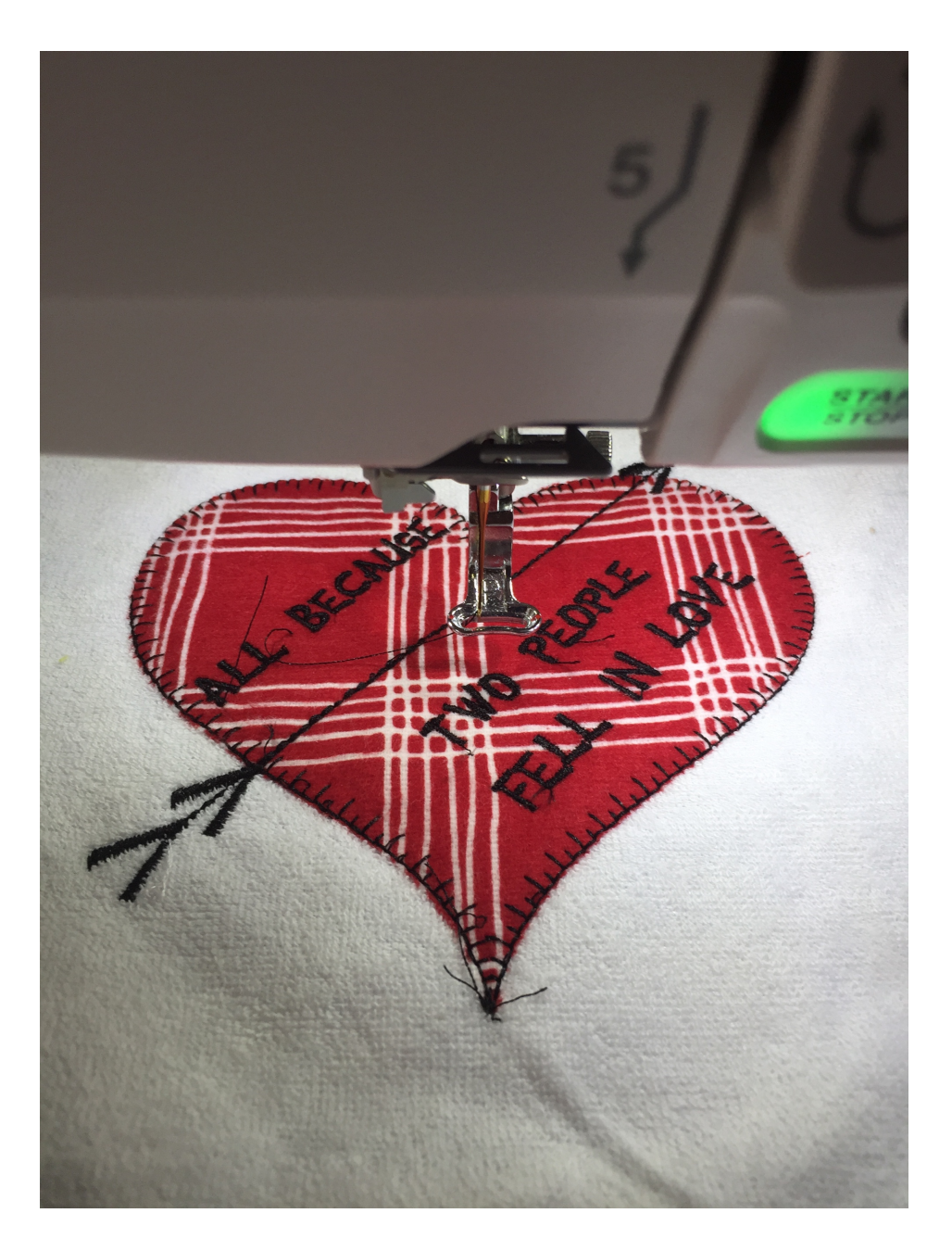
Remove from hoop, cut stray threads, tear stabilizer carefully from back of bib, blanket or onesie. Enjoy!