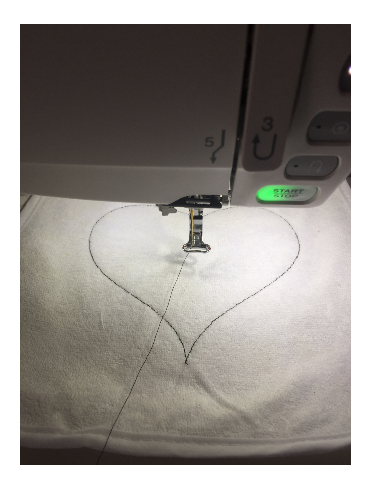
Step 3: Heart Applique Place heart applique within stitched lines Using a small iron, attach the applique