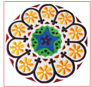
480 Built-in Designs and 700+ Designs included with AcuDesign App