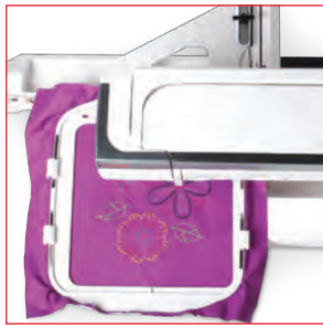
Maximum Embroidery Area: 9.1" x 11.8"