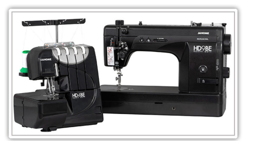
Perfect companion for HD9BE Professional Machine