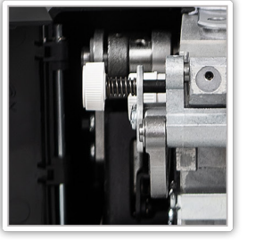
Adjustable Cutting Width