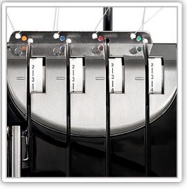
Lay-in Thread Tension Dials

Janome's HD4BE Serger (Black Edition), with its unique color, certainly makes a bold impression. With an electronic foot control, this is an advanced overlocker with 2 needles and 2, 3, or 4 thread overlock stitching. The differential feed ratio, which is adjustable from 0.5 to 2.25, provides exceptional control for handling all types of fabrics and for creating desired special effects. Color-coded thread guides help with machine threading. The guide is automatically returned to its normal position when you turn the balance wheel. The thread tension automatically releases when you lift the presser foot so you can draw through the threads smoothly. The HD4BE also lets you quickly switch to rolled hemming without changing the needle plate. A lower looper pre-tension stitch eliminates the need to change tension for rolled hems.