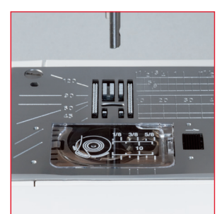
Patented Needle Plate Markings