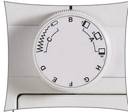
Stitch Selection Dial