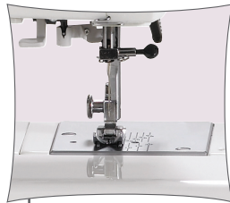
Built-in Needle Threader