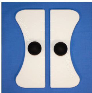
FM Quilting Paddles JA-PDL MSRP: $54.99

Enhance your sewing experience with the Sew Comfortable line of sewing accessories. These new tools from Janome's Sew Comfortable line will help keep your fabric tight while sewing, allowing for more grip during free motion quilting. Also available are square and triangle templates for precise measurement.