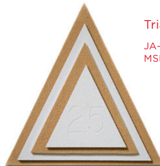
Triangle Template Set JA-TRI MSRP: $21.24

These templates stay secure on your fabric with no-slip material for easy cutting of squares & triangles.