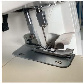
EIGHT PIECE FEED DOG FOR IMPROVED FEEDING

Offering Improved Stability, Power, and Feeding Ability