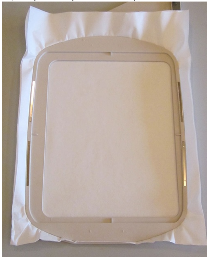
6. Position the patchwork panel over the hoop. The pin marking the crosshair's center point should be directly under the needle. Make sure the patchwork panel is parallel to the sides of the hoop.

5. Hoop TWO layers of tear away stabilizer. Place the hoop on the machine.