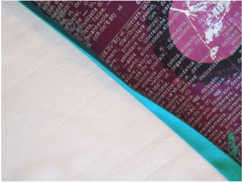
14. Pin in place, then edgestitch in place. Go slowly and take care to insure you catch both the front and back of the binding. Switch the thread to best match the binding strip fabric if necessary.

13. Slip the binding over the folded edge of the left overlap panel.