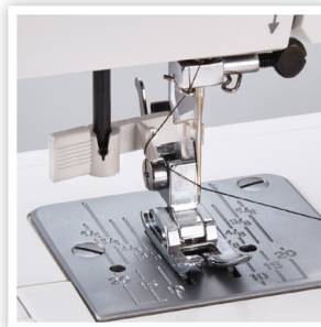
BUILT-IN NEEDLE THREADER