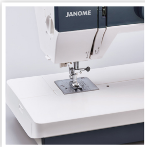
EXTRA WIDE SEWING AREA