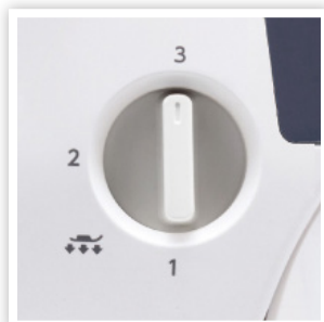
FOOT PRESSURE ADJUSTMENT DIAL